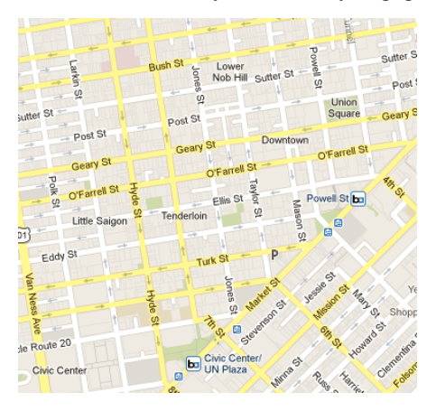
Figure 2: Neighborhoods in and around downtown San Francisco including Little Saigon, Tenderloin, and Union Square.

only a few blocks from Union Square, but in one you will find a high crime rate and inexpensive South Asian food, and in the other you will find high-end retail. Further complicating matters, the context that defines these regions is dynamic. Consider safety in a military engagement. An