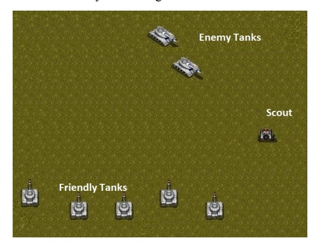
Figure 3: If the Scout was ordered to safety, it would need to reason about the future actions of the Friendly and Enemy Tanks.

agent moving to safety must consider the capabilities, knowledge, and goals of the other participants. For example, in Figure 3, if the friendly tanks are advancing on the enemy tanks, the enemies may retreat and the scout is already safe. Although they operate at a different time scale, there are dynamics in the previous two examples as well. The locations of the desks in a classroom or the landmarks of a city will change over time.