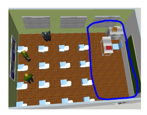
Figure 1: The front of the classroom depends on locations and orientations of the desks and other objects in the room.

We call such areas context-dependent spatial regions (Hawes et al. 2012). To identify the front of a classroom, one must recognize the boundaries of the classroom (e.g., the walls), the objects within the room (e.g., desks and whiteboards) as well as their functional use (e.g., students sit at the desks oriented toward a teacher). These regions are important for communication because they are tied to the goals and intentions of the actors in the environment. If someone wants to present, they stand in the front of the classroom. Neighborhoods are functional, geographic areas of cities. They provide a heuristic for people in terms of businesses, real estate prices, and crime. The Tenderloin is